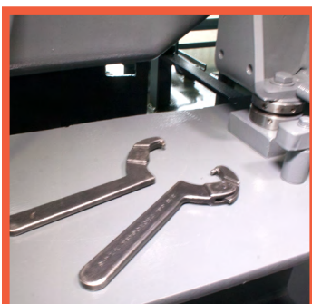
Spanner tool adjusts height for a perfect fit