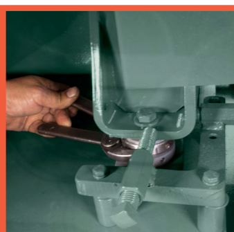
Easily realign during the life of the component.