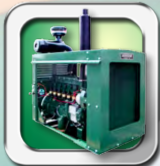
A-54 Power Unit