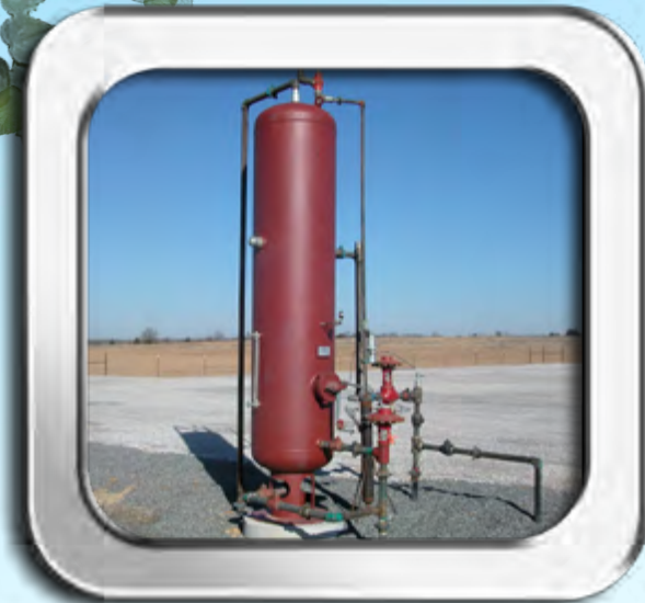
ASME CODE VESSEL