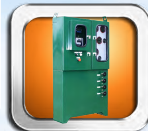
Electronic Control Panel