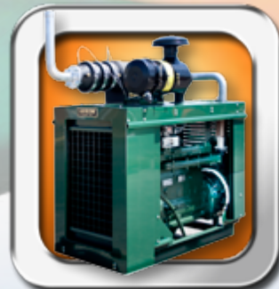
A-62 Power Unit