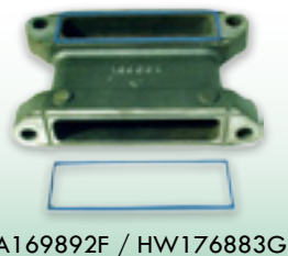
A169892F / HW176883G