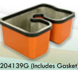
A204139G (Includes Gasket)