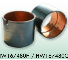
HW167480H / HW167480G