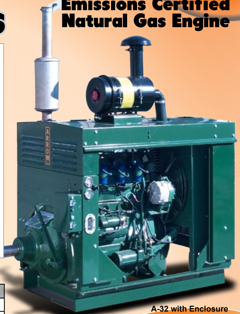
A-32 with Enclosure