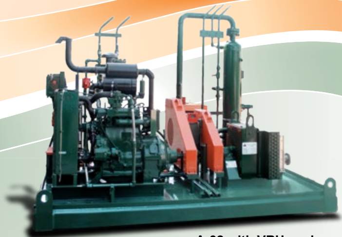
A-32 with VRU package