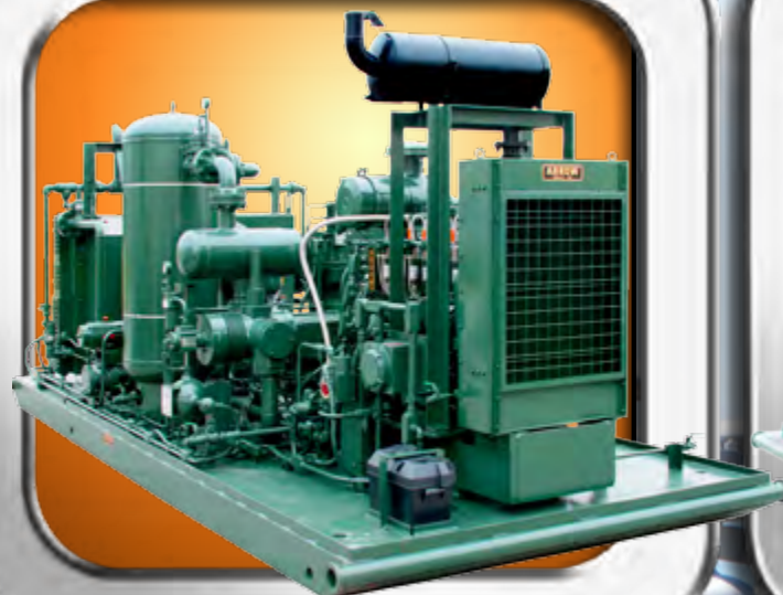
GAS LIFT PACKAGE