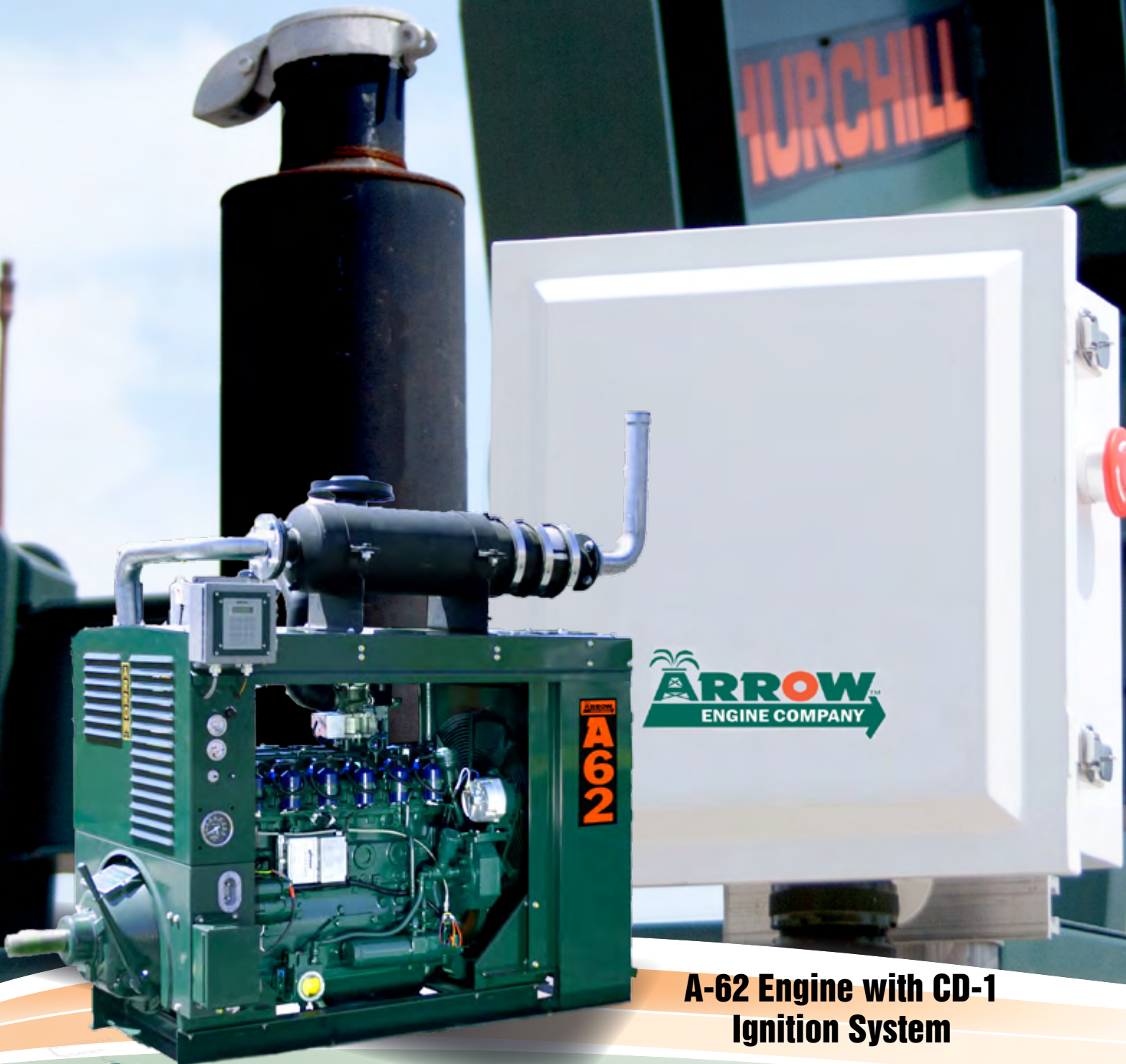
A-62 Engine with CD-1 Ignition System