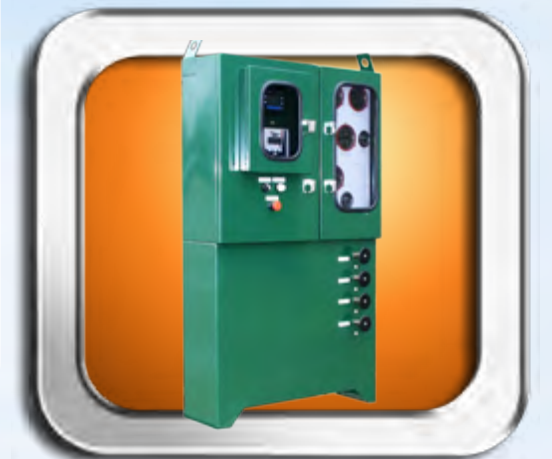
Electronic Control Panel