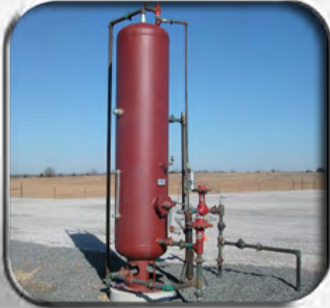
ASME CODE VESSEL