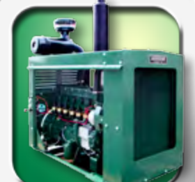
A-54 Power Unit