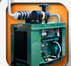
A-62 Power Unit