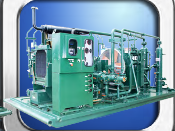
FIELD GAS PACKAGE